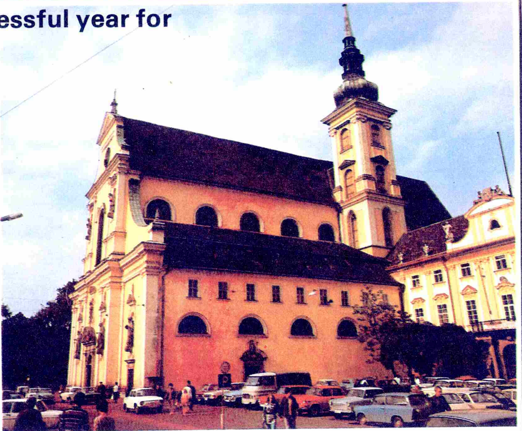
The Museum of Communist Party History, Brno, Czechoslovakia.

Deliveries of Redifon equipment to Czechoslovakia during the month of September 1978 broke all records for the company. Nearly £1,000,000 worth of equipment was delivered, including three of the systems