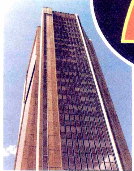
The Motokov Foreign Trade Corporation building in Prague.

The Slovak Forestry Commission in Bratislava has ordered an R300 with 10MB disk and 16 terminals.