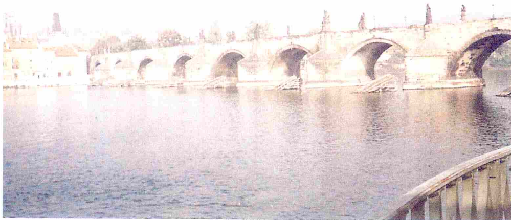
Prague's River Vltava, with Charles Bridge and Prague Castle in the background

F rom the early 1970s ROCC (then Redifon) has been a computer supplier to Eastern Europe. The West's desire to reach out to the East in order to thaw the cold war was enacted through a political initiative called 'detente' and reciprocated by the East's need for modern western technology. As a result, in 1972 ROCC granted a licence for the manufacture of its original SEECHECK® proprietary computer systems to the Polish MERA combine in Warsaw.