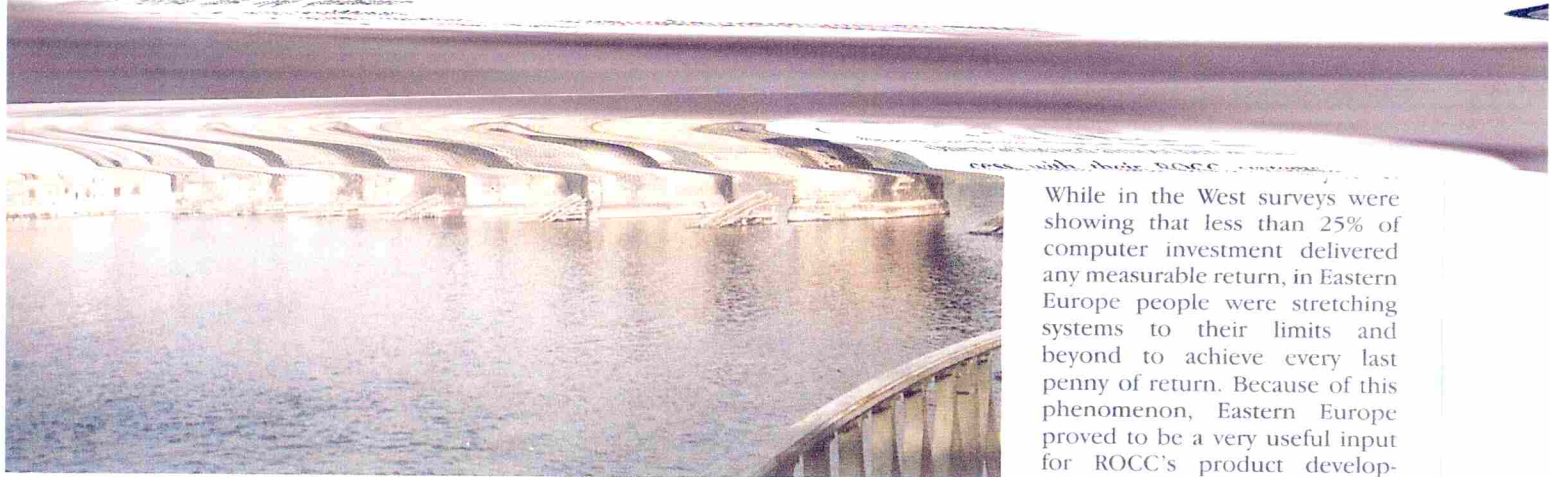
Prague's River Vltava, with Charles Bridge and Prague Castle in the background

F rom the early 1970s ROCC (then Redifon) has been a computer supplier to Eastern Europe. The West's desire to reach out to the East in order to thaw the cold war was enacted through a political initiative called 'detente' and reciprocated by the East's need for modern western technology. As a result, in 1972 ROCC granted a licence for the manufacture of its original SEECHECK® proprietary computer systems to the Polish MERA combine in Warsaw.