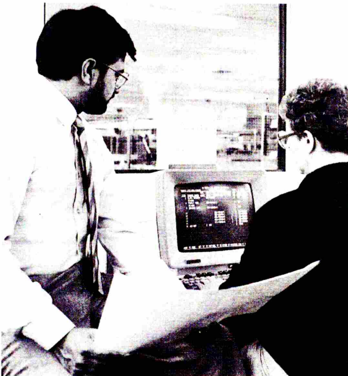
Hewins.... "We can use staff more effectively than before."

Hird-Jones concluded, "We have been amazed at the sophistication and flexibility of the systems we have been able to develop on the ROCC computer but we haven't finished yet!"