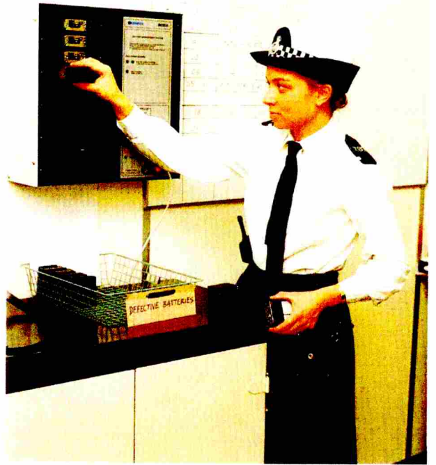
Redifon's BC20 Series Battery Management System. The battery for handheld portable radios.

tively than before and so increase the overall productivity and profitability of the company. New parts lists had previously to be drawn up manually by engineers. We can now do this on the computer using clerical staff, and so make available the time of those engineers for work which better utilises their expensive skills," concluded Hewins.