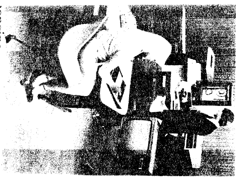
anging e of rice

what constitutes an company says its focuses attention on 'within' and 'without' communications problem in solutions. Until now, it computer-based systems been used to improve within' organisation communications — bringing