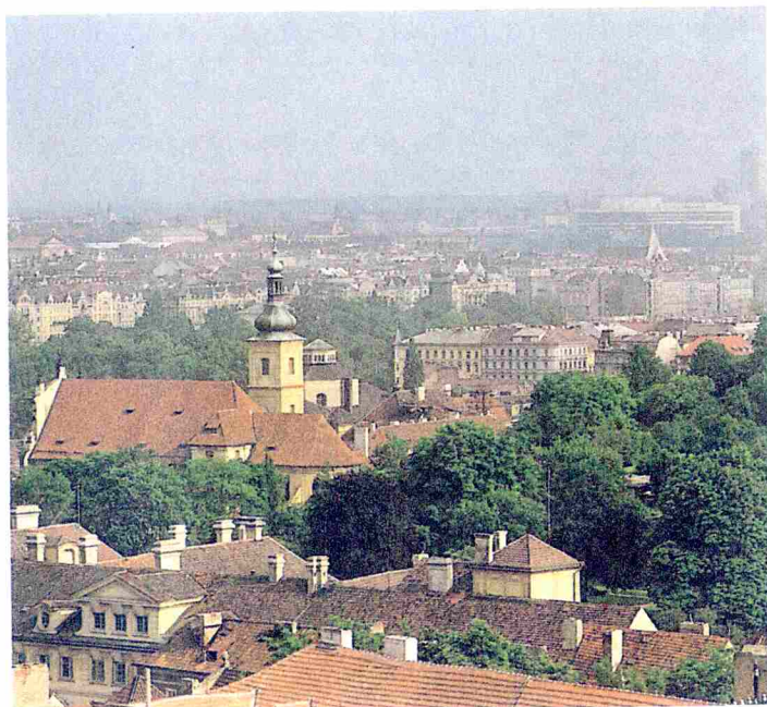
View from Prague Castle.